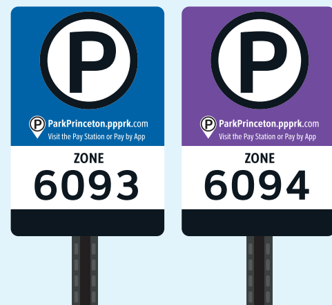
PAYSTATION PARKING ZONE SIGNAGE

A zone number identifies where you are parking and can be found on signage in the pay station areas and on meters in the short term parking areas.